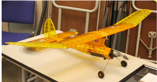
Dick Miers' Speed 400 Bomber