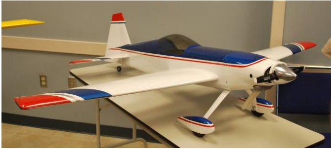
Tom Hayes' Great Planes Revolver