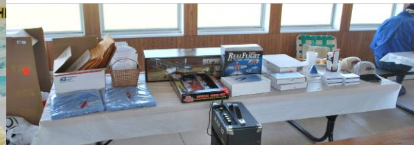
Toys For Tots Nov 2009