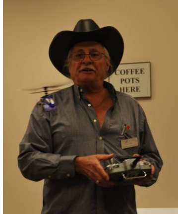
Terry Holston's MSR micro helicopter