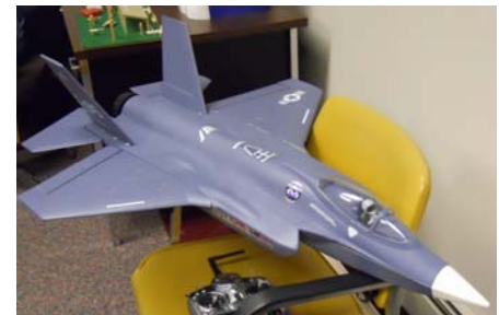
Donald Snyder an EDF Vectored thrust F-35 foam jet