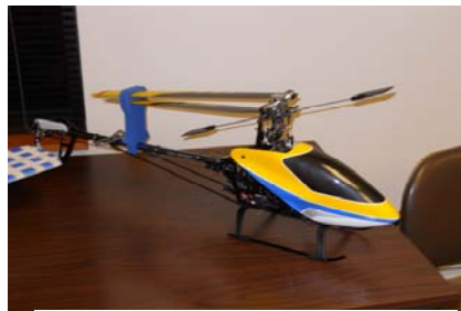
Jim Smith showed an EXI 500 helicopter