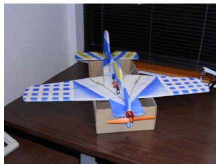
Joe Smith showed a scratch built Yak55