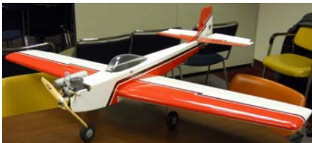
Ed Leonard showed a Kaos 40