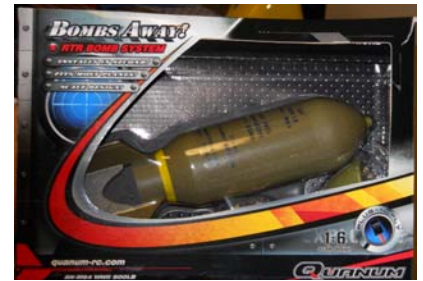
Dean Bobay showed a remote released Bomb