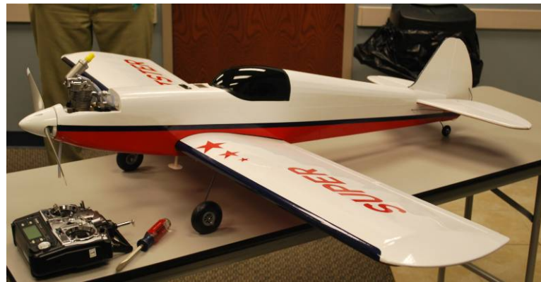
Bob Hunt's Super Sportster