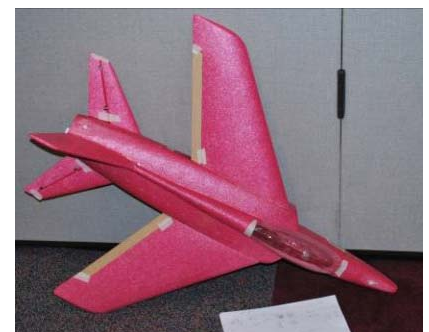
Pat mattes' Pink foam Jet