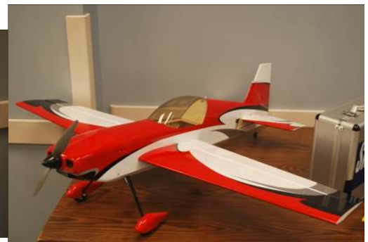
Joe Smith's 3DHS Velox 48"