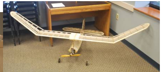
Dick Miers' 96" Lanzo's Bomber in "the bones"