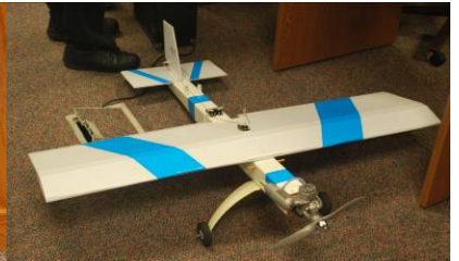
Karl Pfister's Paintball Plane