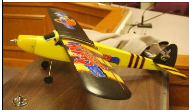
Dean Bobay's converted Fly Zone Model