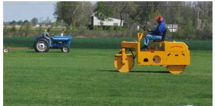
More of field opening day Sat April 17.