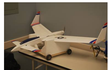
Gary Hill's Canard and Foam Take-off system