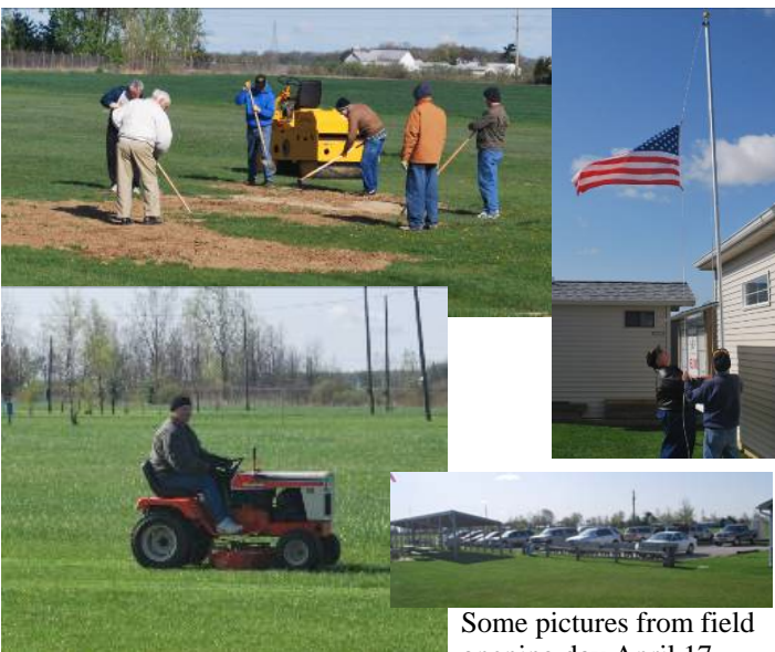
Some pictures from field opening day April 17

We are collecting aluminum cans for recycling and now have a special can at the field for them. Please donate your aluminum cans by bringing them with you to the field.