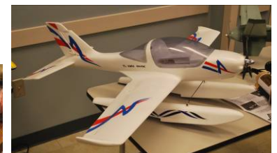
Pat Mattes' TL 200 float plane