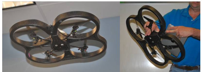
Don Snyder's I-pod Controlled Helicopter