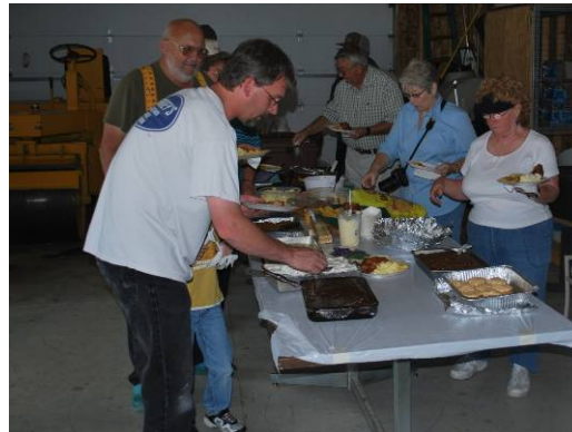
Getting ready to eat at club picnic