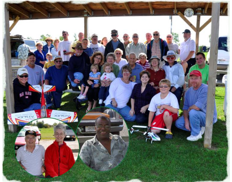
Group picture of attendees of club picnic