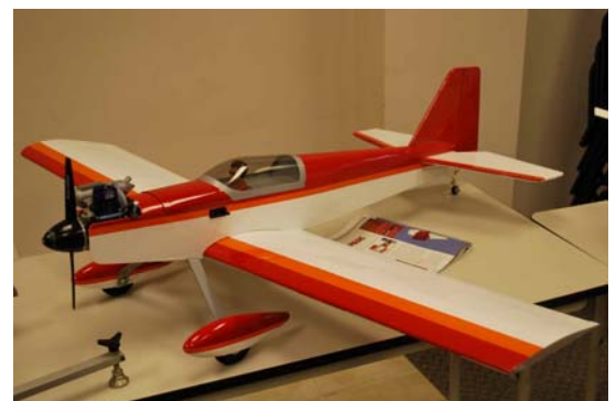
Ron Blackman's Great Planes Escapade