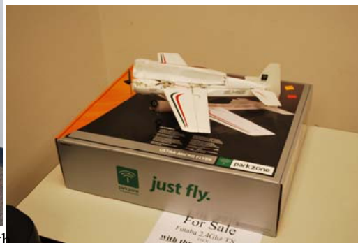
Kevin Loughin's micro Sukhoi modified