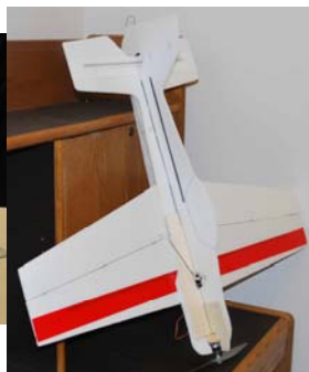
Art Peletier's Flat Foamie