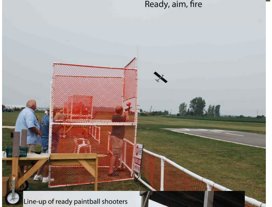
Line-up of ready paintball shooters