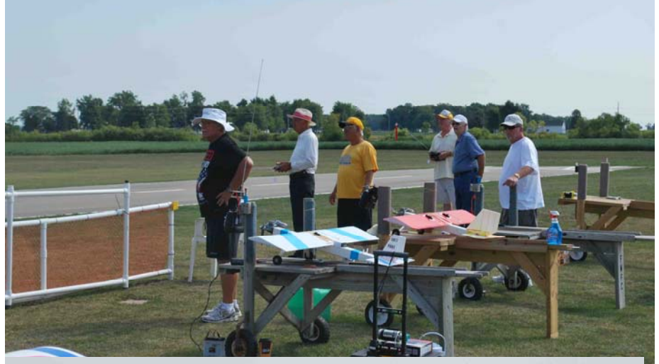
Ready, aim, fire